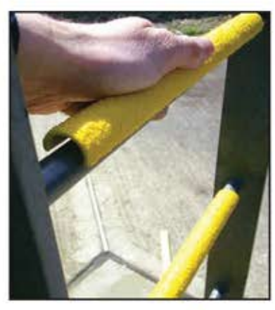
Ladder Rung Covers () (showing ease of installation)