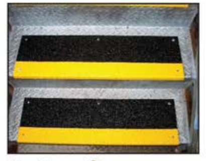
Step Covers 0