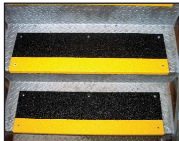
Step Covers ⓘ