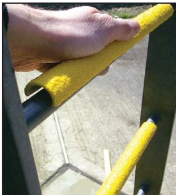
Ladder Rung Covers ⓘ (showing ease of installation)