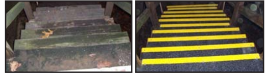
Before and After shots show product application.