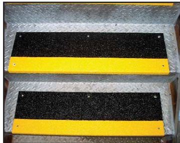
Step Covers ⓘ